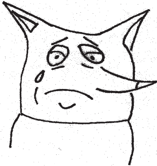
PIRULÍ TRISTE O MELANCÓLICO